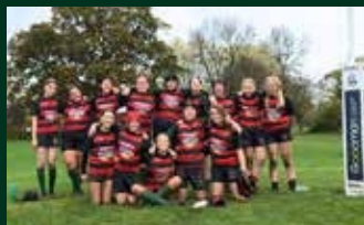
U14W Years 8 & 9