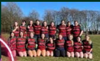
U16W Years 10 & 11