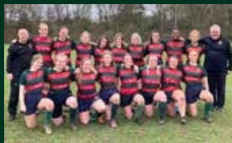
U18W Years 12 & 13