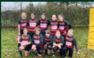
U11W & U12W Years 5, 6 & 7